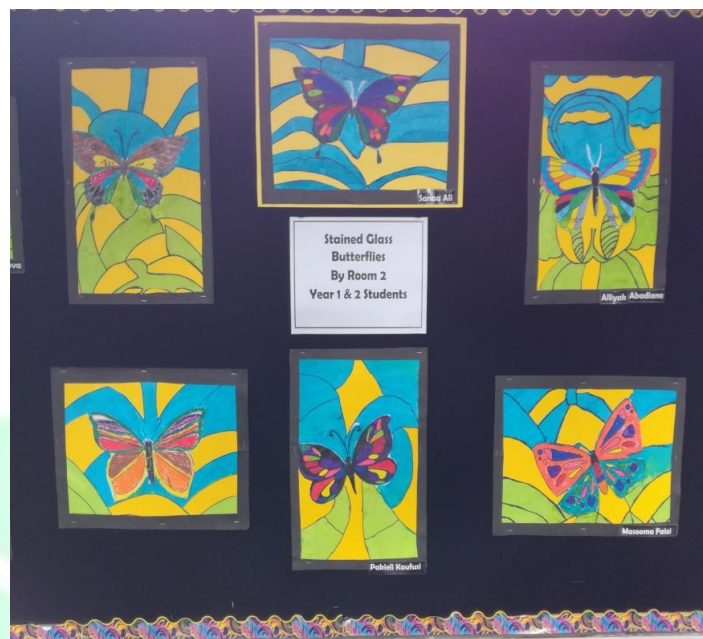
The Lifecycle of a Butterfly

Butterflies are insects because they have six legs. A butterfly has four stages in its life cycle. First the mother butterfly lays eggs on a leaf. The eggs are really small and round. Next the eggs hatch into a tiny caterpillar. A caterpillar is sometimes called larvae. Then the caterpillar eats lots of food and makes a chrysalis. Another name for a chrysalis is a pupa. This is the resting stage. The caterpillar starts to change and it turns into a butterfly last, the chrysalis opens and a butterfly comes out.